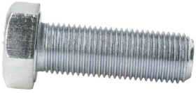
4-5/16" X 3/4" BOLTS