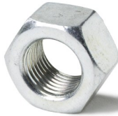
4-5/16" LOCK NUTS